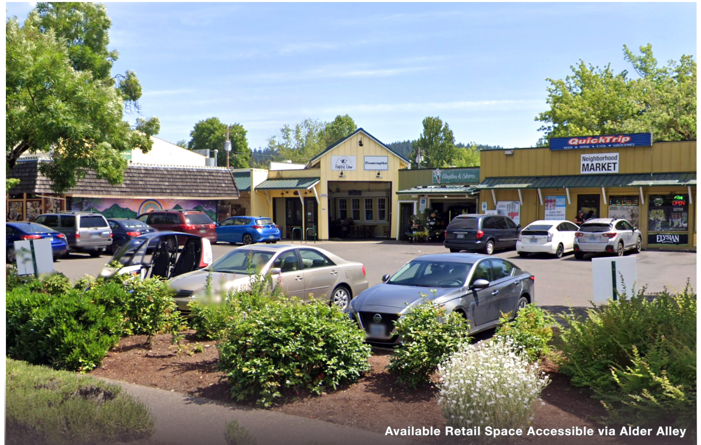
Available Retail Space Accessible via Alder Alley