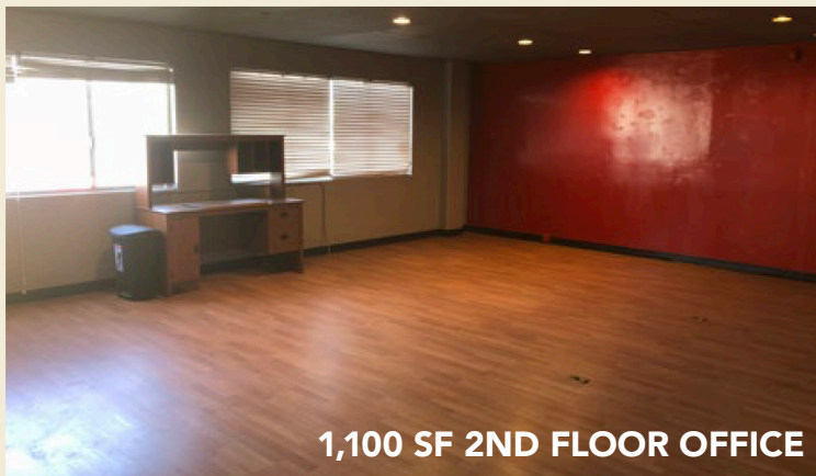
1,100 SF 2ND FLOOR OFFICE