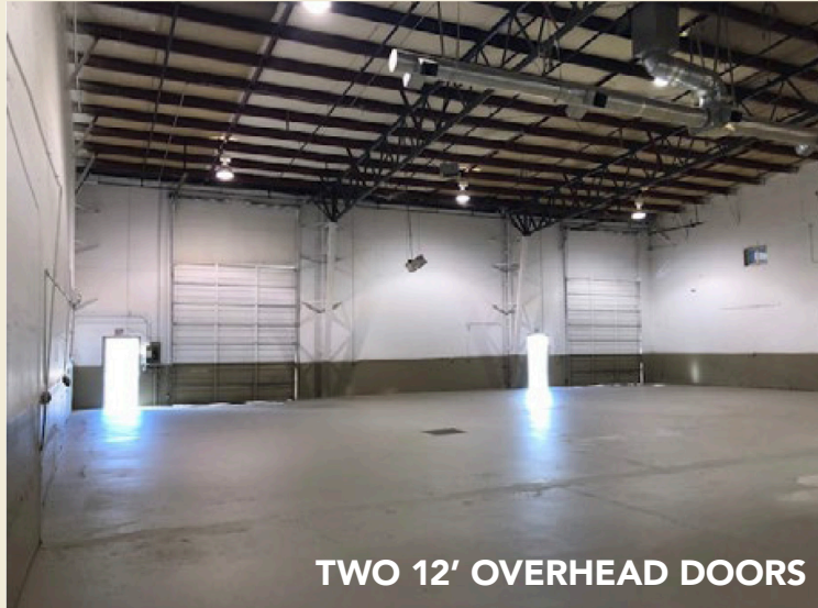
TWO 12' OVERHEAD DOORS