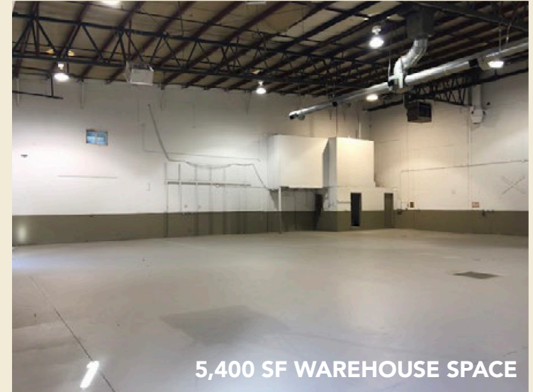
5,400 SF WAREHOUSE SPACE